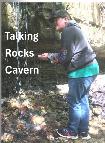
Talking Rocks Cavern