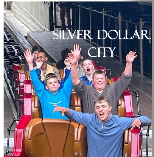
SILVER DOLLAR CITY