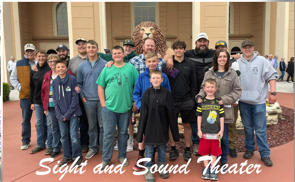
Sight and Sound Theater